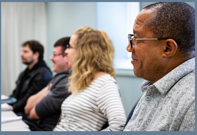
College Students from 2019

To find out more about these and other courses offered by ABC, please contact Kim Salcedo at <a href="mailto:admissions@abccampus.ca">admissions@abccampus.ca</a> or call 403.282.2994, ext. 230.